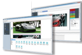
Media Editor Software Suite